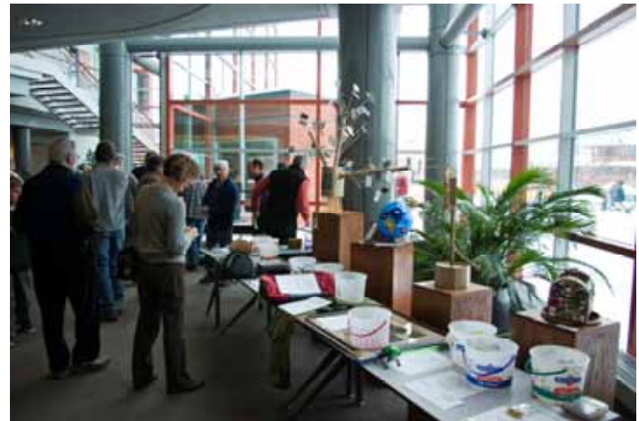
Looking over just a few of the raffle items!