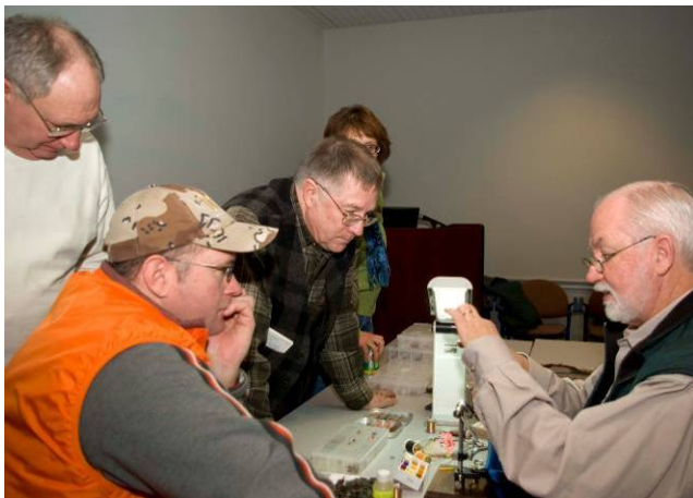
Gathering 'round the vice in the tying room