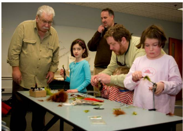
Some Stream Explorers tying up some real fish catchers