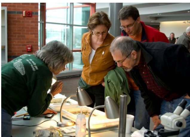
It's not every day you get to discuss insects with an actual entomologist