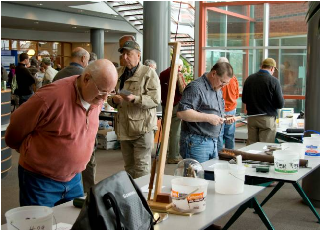
Checking out the mighty array of raffle items