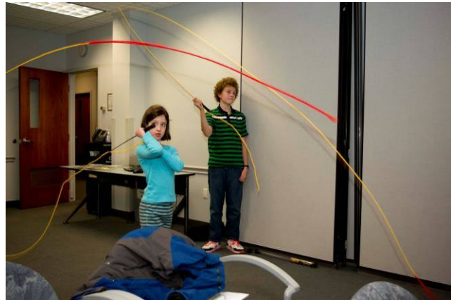
Casting practice in the Stream Explorers Room