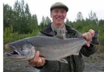
August silver salmon

The Lodge offers excellent Alaska salmon fishing and trout fishing in their picturesque clearwater river. King Salmon are the first species to enter their river system in early June.