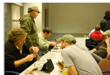
fly tying demonstrations