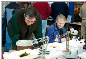
aquatic life demonstration

For a schedule, map and more... go to www.swtu.org