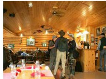
Main lodge interior

Wilderness Place Lodge is a deluxe Alaska fishing lodge accomodating a maximum of 16 people in 6 private riverside cabins. Comfort, courtesy, fine food, custom itineraries, attentive guides and excellent fishing combine to maximize your Alaska lodge experience.